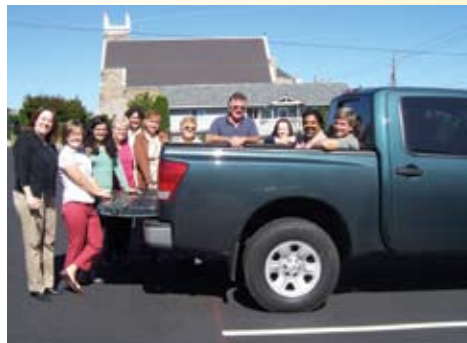
The Tacoma/Pierce County Habitat for Humanity office staff celebrates the arrival of a brand new Nissan Titan truck, one of 10 trucks that Nissan North America donated to Habitat affiliates across the country.

To buy a certificate, stop by the store: 505 Puyallup Avenue, Tacoma, Tuesday through Friday, 10 am to 6 pm, or Saturday, 10 am to 5 pm.