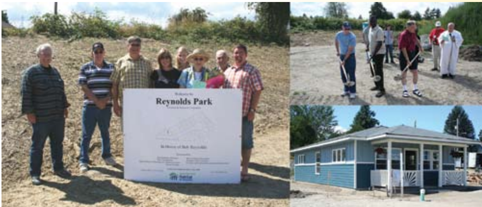
The Tri Party at Reynolds Park on August 4 included the Women Build dedication, the dedication of the park, and the groundbreaking for the now-completed Building on Faith home.